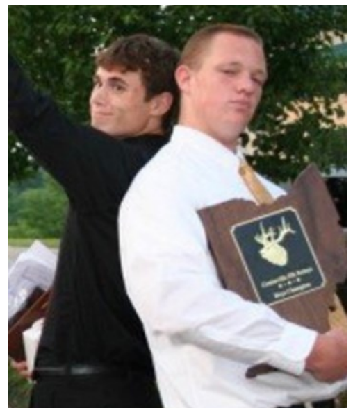
The dynamic duo showing off their athletic awards.