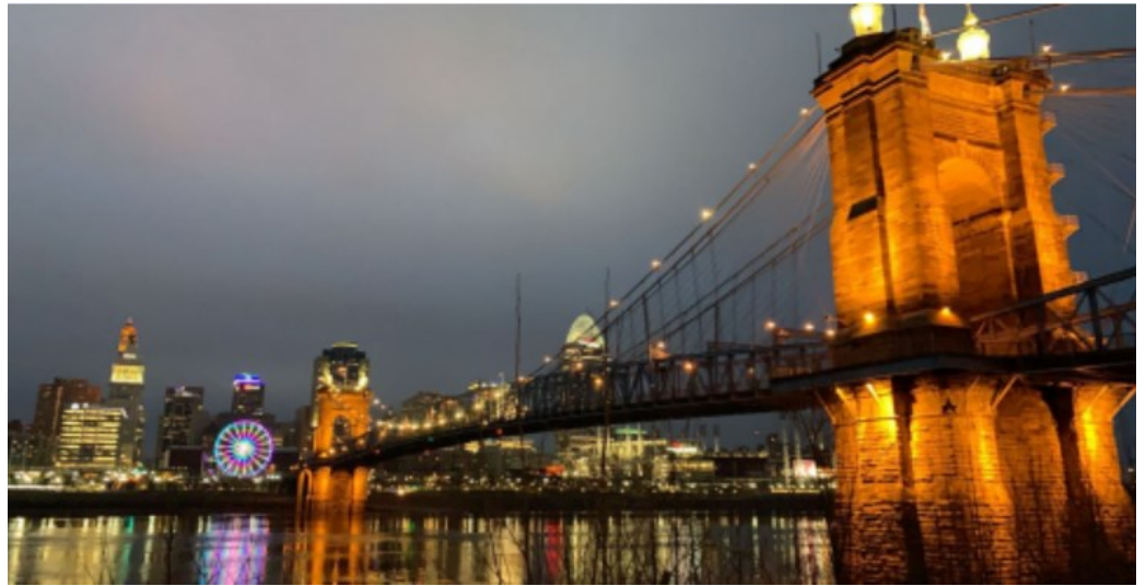
The City of Cincinnati

Another Cincinnati favorite, located downtown,