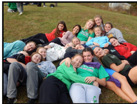
MND and Seton students cuddle on the grass at local family's house.