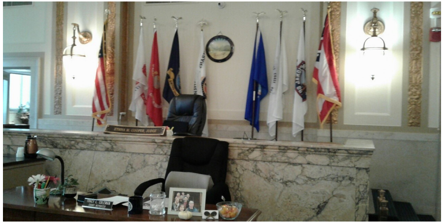
A silent , calm courtroom just moments before the judge enters.

This program allows veterans to have something to work towards: a goal. Instead of getting things handed to them, the vets are given the tools they need in