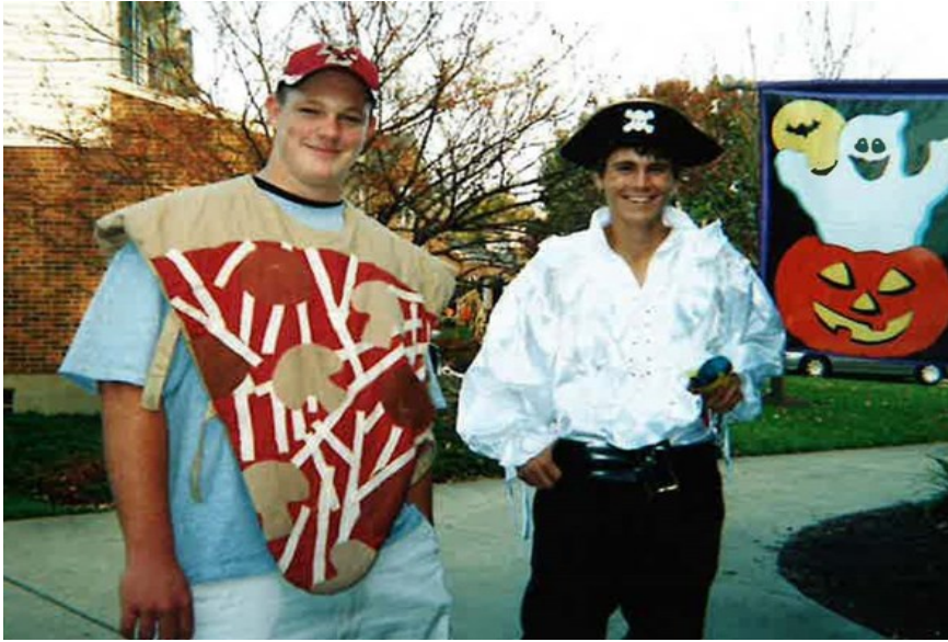
A 2004 pizza and pirate enjoying their high school years.