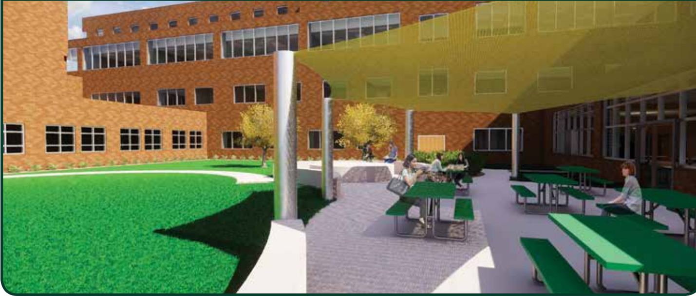
We are proud to be providing our students with an optimal learning environment.