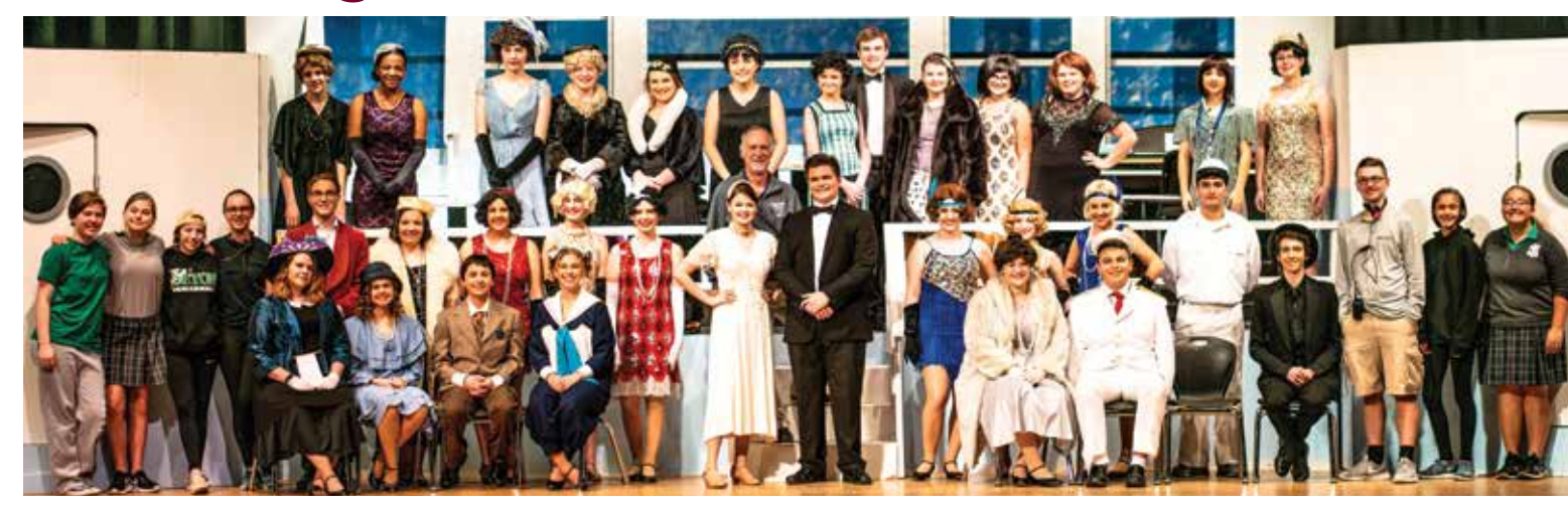
The Seton-Elder Drama Club received rave reviews for their fall play, Peril on the High Seas. Congratulations to the cast and crew!