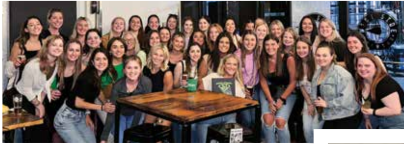
(Left) The Class of 2017 celebrated their five-year reunion at West Side Brewing in May 2023.