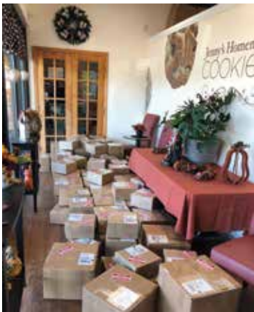
A large corporate cookie order is ready to be shipped across the country from Jenny's Homemade Cookies.