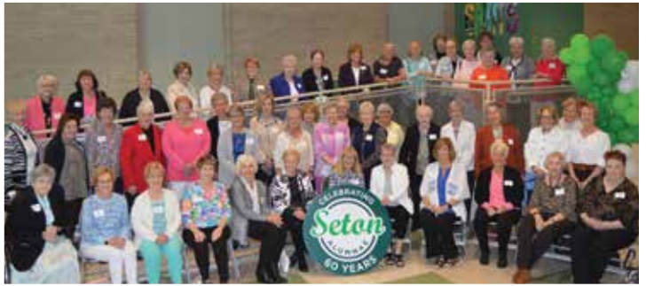
(Below) The Class of 1977 celebrated their 45-year reunion at Seton in May 2023.